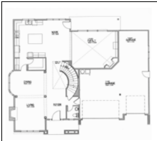
*Upper Level (2,115 sq ft)

*Prices, plans, specifications and features are subject to change without prior notice or obligations.